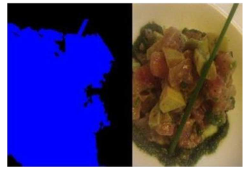
Fig.3. Segmentation Result

Calorie Count = Per pixel calorie count * pixel count of food area.