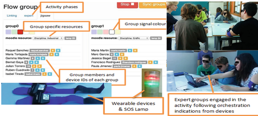
Fig. 3. SOS orchestration configurations, devices and activity enactment at different phases

experiment. In the table, “P” denotes the total number of participants and when P is known, the constraint values could be derived accordingly.