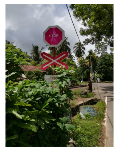
Figure 8. Safety Signs fixed too close to the Level Crossing

During the field observations, it was confirmed that the most of the warning signs and safety sign boards were fixed too close to the railway-roadway level crossing. This kind of placement affects the perception reaction time of the drivers and it contributes to the occurrence of a fatal crash at an unprotected level crossing with bad sight distance. For example, Figure 8 shows a low sight distance level crossing near Aluthgama with safety signs fixed too close to it.