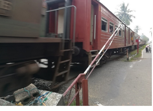
Figure 6. Partially Closed GI Gate

Figure 7 shows a GI gate which does not exist due to the lack of proper maintenance. The gate has been replaced by a rope and red cloth. Considering the sight distance from the seaside, 31% had a moderate sight distance and 10% of level crossings had a bad sight distance. Considering the sight distance from the land-side, 16% had a bad sight distance and 27% of level crossings had a moderate sight distance. Vehicle drivers are unable to suddenly control their speed while approaching a level crossing. Therefore, in such low sight visibility areas, pave rumble strips or asphalt bumpers on the road surface should be made in order to control the vehicle approaching speed. Since there are unprotected level crossings with bad sight distance, this step would help in giving the vehicle driver time to observe the level crossing before crossing it.