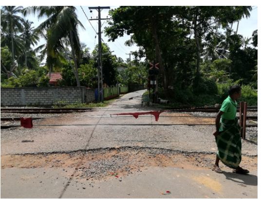
Figure 7. A GI Gate replaced with Rope and Red Cloth