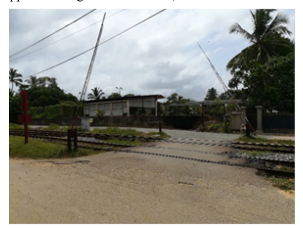
Figure 1. A Level Crossing in Sri Lanka

A level crossing is a location where a railway and a roadway, or two railway lines, crossing at the same level on the ground [2]. Figure 1 shows a protected level crossing equipped with a gate in Wadduwa, Sri Lanka.