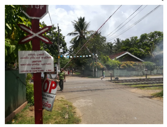
Figure 2. A Crossbuck found in Sri Lanka

Passive level crossings are road-rail crossings that are only protected by warning signs and are normally found on roads that have less traffic. Warning signboards fall into this category. A passive level crossing notifies that the railwayroadway crossing is a dangerous place and road users should be careful at all times. It warns the road users to expect an approaching train and to always give priority to the train if it comes without trying to outrun it. Accidents are more likely to occur at passive crossings because the vehicle drivers on the road may not identify the approaching train [5]. The main passive control systems are the warning boards and signs indicating the position of a level crossing. Crossbucks are among one of the most used passive safety systems. These are found around the world and even in Sri Lanka as shown in the Figure 2. In the United States (USA), the back to back crossbucks are used on each of the railroad intersection [6].