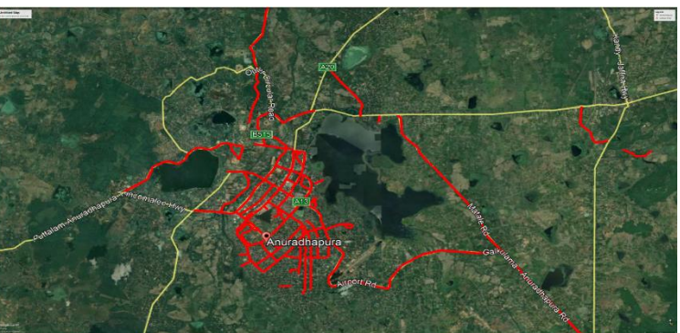
b) Polonnaruwa District Road Sections