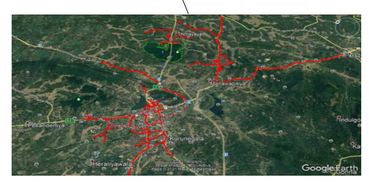
c) Kurunegala District Road Sections

Figure 1. The Selected Road Segments in the Study Area