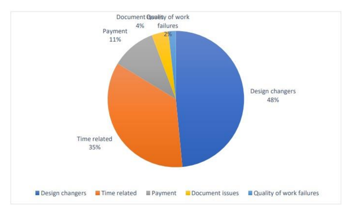
Figure 1- Claim distribution according to the type of dispute

5 disputes are highlighted in the documentary survey such as; design changes, payment-related issues, time-related issues, documentation, and work quality. With a ratio of 44%, the majority of disputes involve plan-changers, as depicted by the graph, with a disparity of 8% between time-related and planning-related disputes. These issues have a significant impact on the success or failure of negotiations. Disputes over documentation, work quality, and other issues have a lesser impact. Their combined percentages equal 7% -13% of the factors pertaining to payment-related problems. Lastly, conflicts regarding design are common in design-build projects. Whether or not project disputes may be identified depends on the procurement procedure.