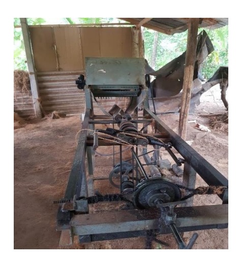
Figure 2- Twin spindle coir rope machine

The twin spindle coir rope making machine (Figure 2) was used to make 10mm diameter coir ropes. Next these produced ropes were bath in a resin basin. This phenomenon is expected in the pultrusion process in this process the fiber ropes are sent through a resin bath and hardened.