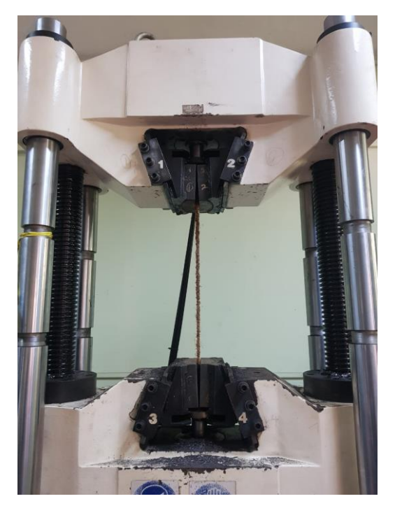
Figure 5- Testing the coir fiber using the Universal Testing machine

Following the guidelines provided by ASTM D7205, the tests were carried out using a universal testing machine (Figure 5).