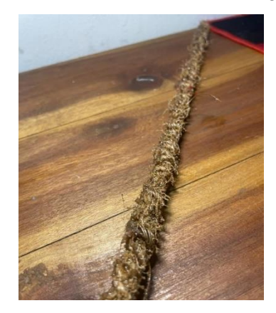
Figure 4- sand coated hardened Coir Bar