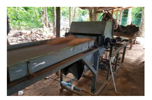
Figure 1- Coir Rope making Machine

The twin spindle coir rope making machine (Figure 2) was used to make 10mm diameter coir ropes. Next these produced ropes were bath in a resin basin. This phenomenon is expected in the pultrusion process in this process the fiber ropes are sent through a resin bath and hardened.