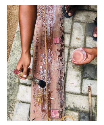
Figure 3- Application of Resin

The coir rope was dipped inside the resin bath to bond the fibers together to form the shape of a bar. Coir and resin volume was calculated to obtain the compositions as presented in the table 2. The exact amount of resin was applied on the rope by tying the rope between two poles as figure 3. A hardener was used at 1:100 ratio to harden the bar after resin bath. During resin bath, the rope was rotated by 180 degrees to distribute the resin evenly across the rope to achieve well rounded bar. Finally, the resin coated jute fibre rope was sand coated before drying the resin. Sand coating is used in fibre reinforced polymer bars to enhance the bond strength between the bar and concrete (Figure 4).