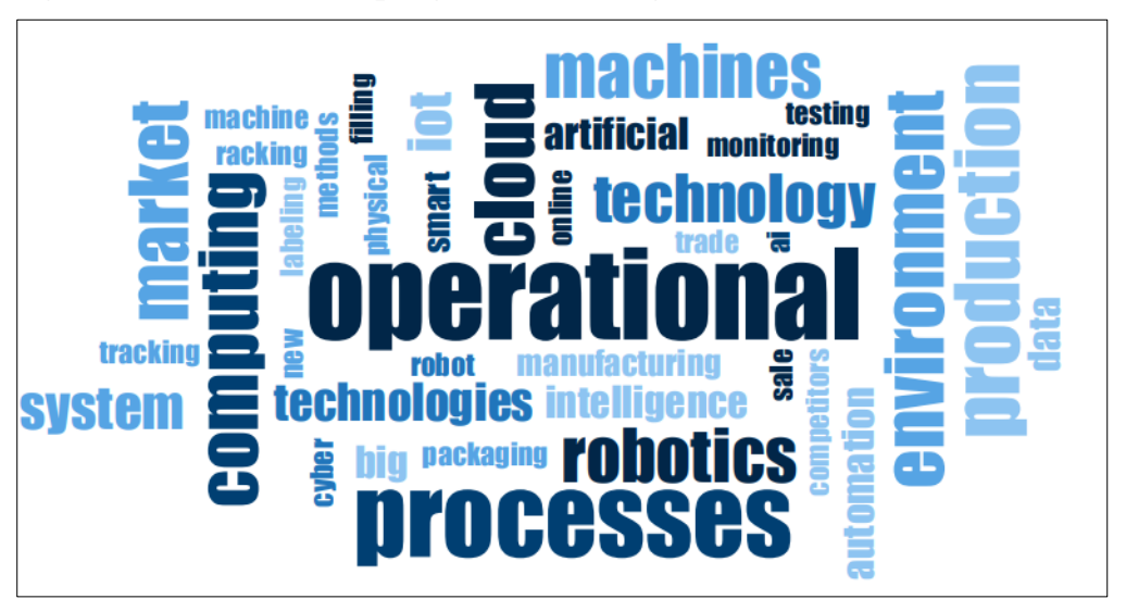
Figure 1. Word Cloud Output generated through MAXQDA

To determine the elements that will influence Sri Lanka's beverage industry's adoption of Industry 4.0 based on the results received. After the data from the in-depth interview with the beverage firm was collected, the researchers were able to pinpoint the instances in which the terms "technology," "operations," "market," and "environment" are employed as research factors. The MAXQDA detected this. As a result, the authors discovered the influencing elements that were applied to the beverage firm in Sri Lanka, which are shown in a word cloud in Figure 1.