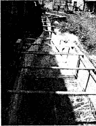
Figure 1. Part of testing set up